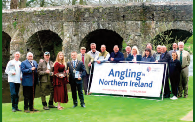
NI ANGLING SHOW

organised by Country Lifestyle Exhibitions Ltd