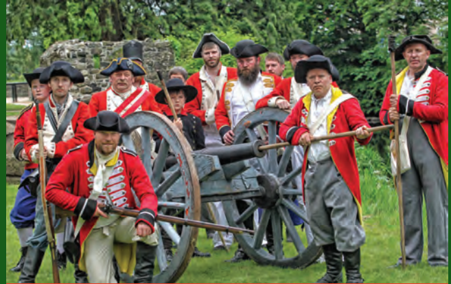
BATTLE OF ANTRIM ENCAMPMENT