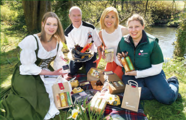
FINE FOOD FESTIVAL